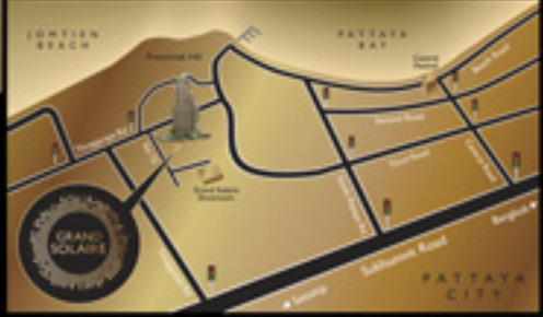
Grand Solaire, Soi 15, Thappraya Road, Pattaya City, Chonburi 20150